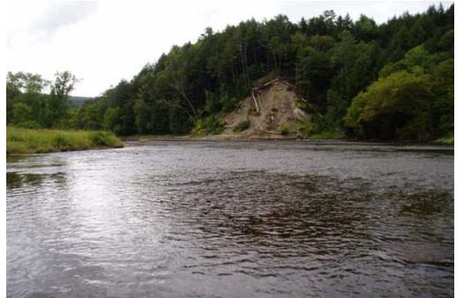
Mass failure downstream of a straightened reach.